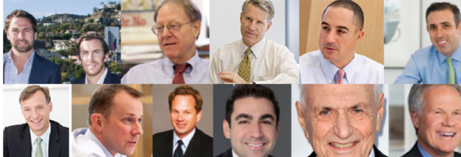
The Townscape/Angelo Gordon (Beverly Hills and New York money) projects team.

Pictured: Developers, Architect, Attorneys and Lobbyists.